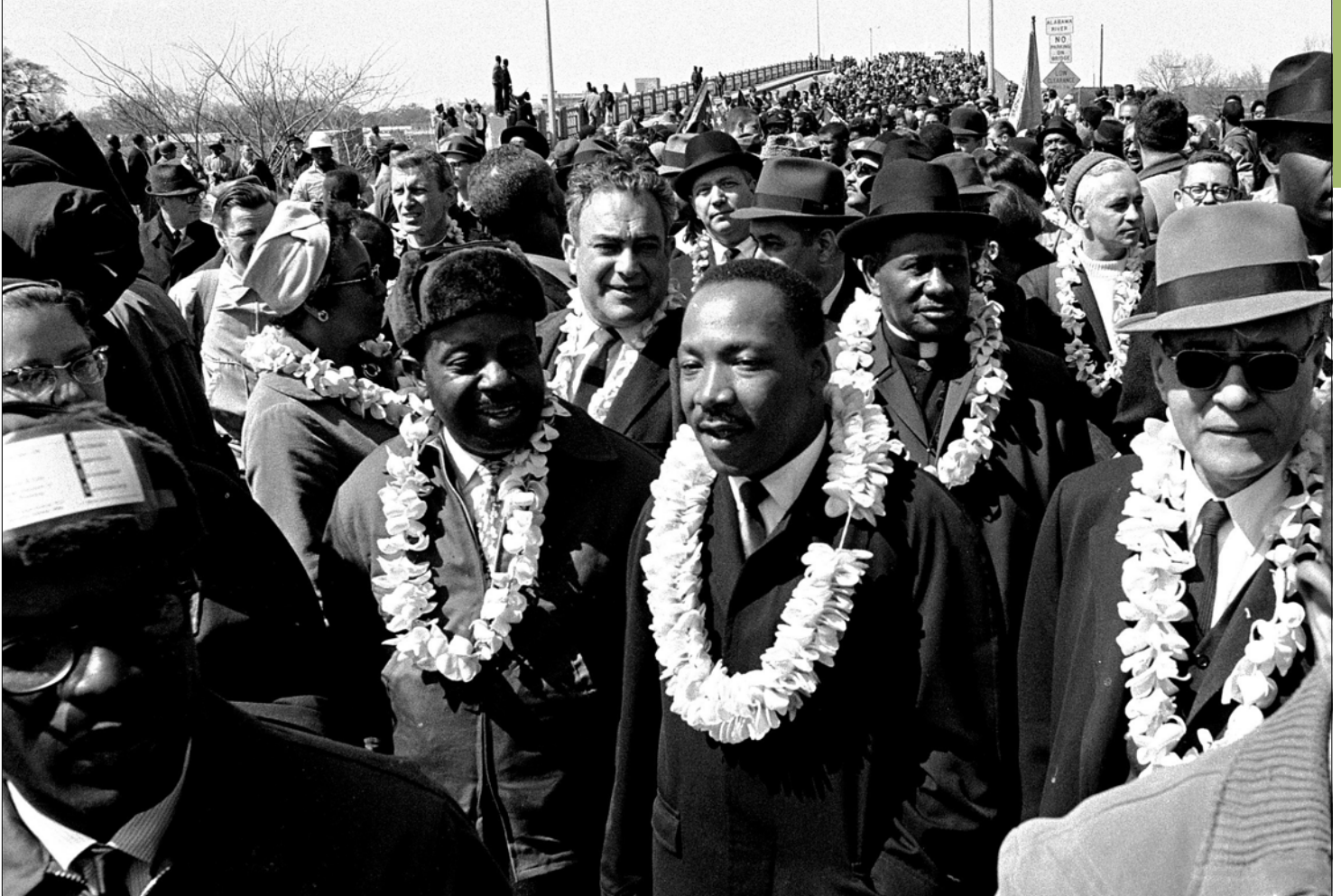
In 1965 Dr. Martin Luther King Jr. (center) led a 50-mile march in Alabama to protest discriminatory voter registration laws.

M artin Luther King Jr. once said: “Life’s most persistent and urgent question is: ‘What are you doing for others?’” Each year, on Martin Luther King Jr. Day, Americans attempt to answer that question by performing community service.