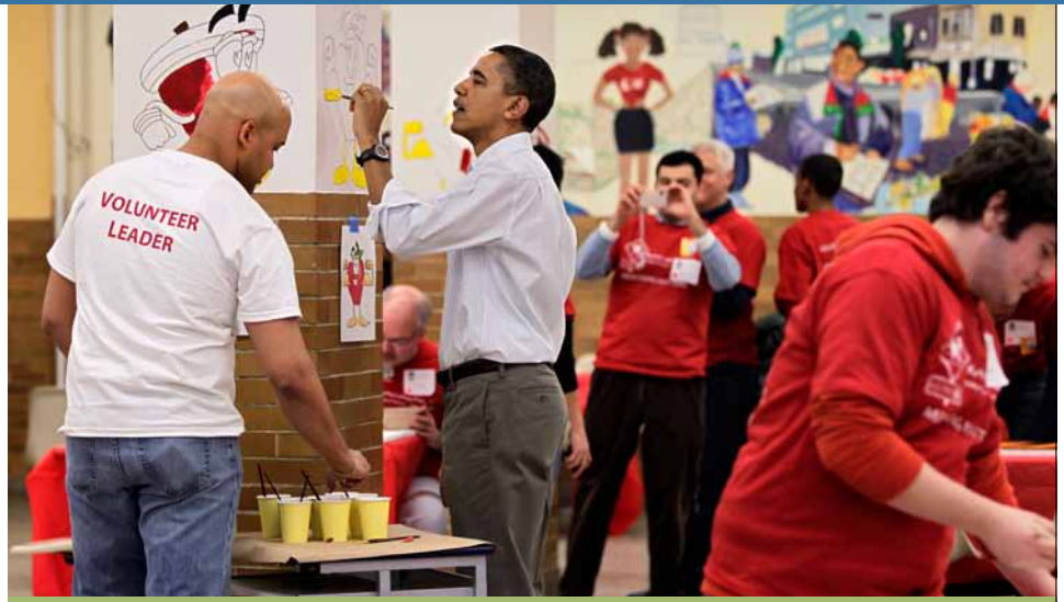
President Barack Obama encourages Americans to observe Martin Luther King Jr. Day by undertaking community service. In 2011, he marked the national holiday by helping to paint a school lunchroom.

Prize for his work to end racial segregation and racial discrimination. He used his prize money to further the objectives of the civil rights movement.